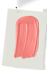
ALL-A-BLAZE 1304 BENJAMIN MOORE

"I love how this color exudes richness without being too stuffy. I recently used it in a pearl finish topped with a strig glaze to complement the orange batik window treatments in a client's Long Island, New York, home. It was my way of bringing a little bit of Palm Beach exuberance to the North Shore!"