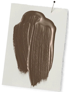
LONDON CLAY 244 FARROW & BALL

Enjoy your next dinner at home amid these jaw-dropping designer-approved hues.