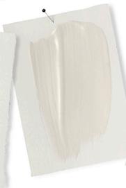
TOQUE WHITE 7003 SHERWIN-WILLIAMS

"Color can be very emotional, so I keep several whites in my repertoire for those times when I'm working with couples whose favorite colors clash and I need a neutral compromise. Toque White is my go-to for dining rooms. Even the most modestly sized one feels extra spacious when painted in this warm shade."