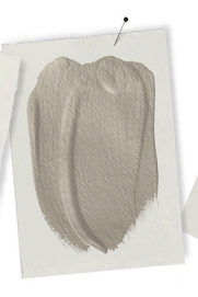
SANDY HOOK GRAY HC-108 BENJAMIN MOORE

"To me, dining rooms are all about encouraging meaningful conversations and exchanges, so I tend toward soft colors that let the guests focus on one another. I chose this tonal gray in my own home to contrast the decor: washed-out white linen chairs, oversize art, and chain-mail curtains—an unexpected touch that filters light for a romantic look."