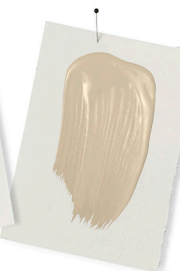
COCHISE DEC761 DUNN-EDWARDS

"For an extensive remodel project in Southern California, I needed a paint that would blend the dining room's dark, cooler-toned, tongue-and-groove ceiling with its gorgeous, creamy limestone wall. Cochise has just the right balance of warm and cool. It has become one of my favorite colors to use in projects where I want the textures of a house to really stand out."