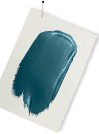
SLATE TEAL 2058-20 BENJAMIN MOORE

"I've always loved the vivid blue, green, and gold palette of James Abbott McNeill Whistler's famous Peacock Room at the Freer Gallery of Art in Washington, D.C. That was the inspiration for a formal dining room in Scarsdale, New York, which I bathed in a rich peacock blue. A glass-orb chandelier with gold leafing made the brilliant wall color sing."